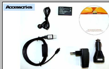
PTS-P33 Your solution for Personal Tracking